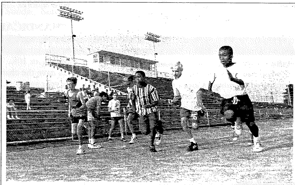
Some of the 112 participants in the CTC youth track program sprint toward the finish line at the Hickman track.

CTC relies on volunteer help, and this year we had a superb crew