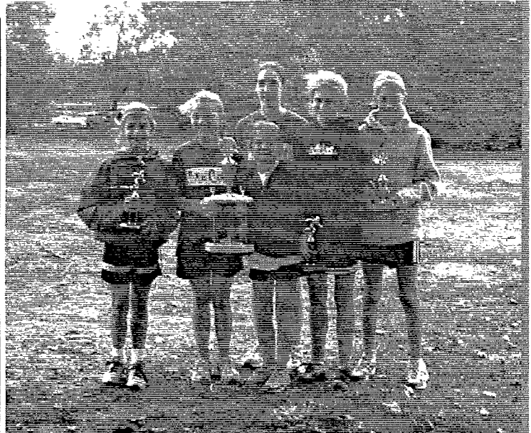
The girls placed first in the Columbia meet.