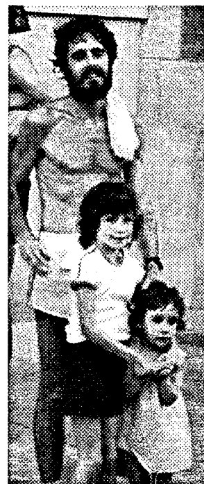
Heart of America Marathon Finisher 1979