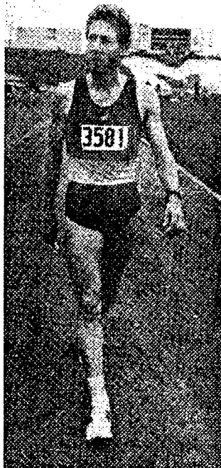
Winner Human Race VI May 1984