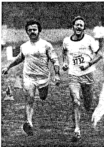
Human Race VI 8th and 9th place finishers May 1984